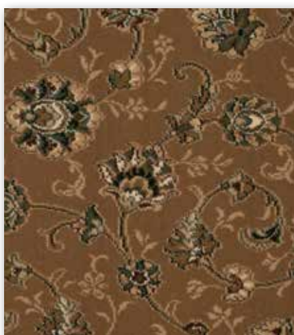
▲ Antique gold 70