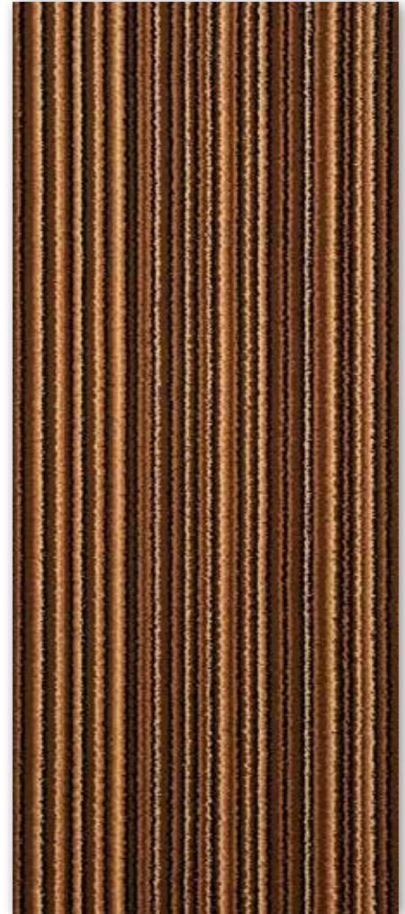
▲ Antique gold 70